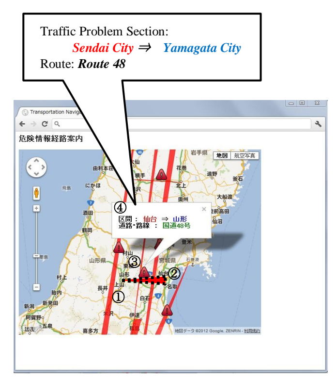
Figure 2. The system that provides traffic problem.

They targeted disaster events such as earthquakes and typhoons. As an application, they constructed an earthquake reporting system.